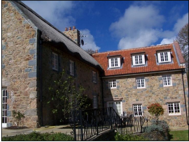
'La Falaise', Guernsey - Very Large & Very Leaky

Other Contractors / Sub Contractors: Eco Drilling Services. Helper: Our on-site Gardener Hero.