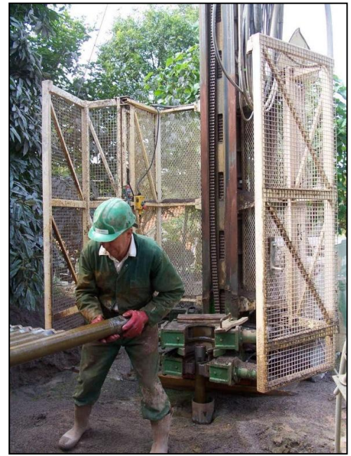
Our drilling engineer loading extensions.