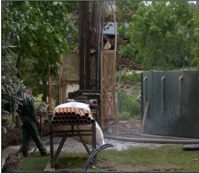
Drilling 145 metres into the Earth. 6 times.