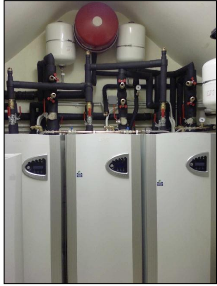
Finished Product: Buffer Tank, 3 x 21kW Ground Source Heat Pumps.